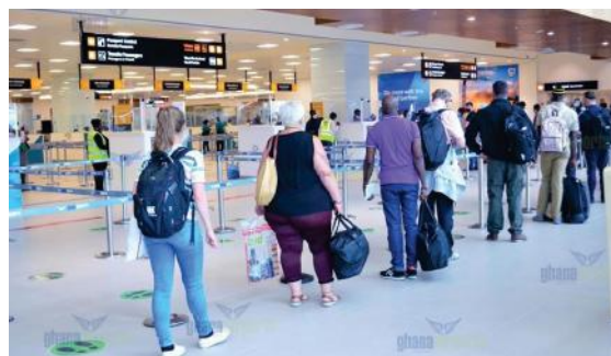
DIASPORA PATHWAY TO GHANA