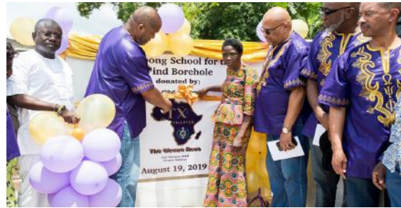
GIVE BACK GHANA