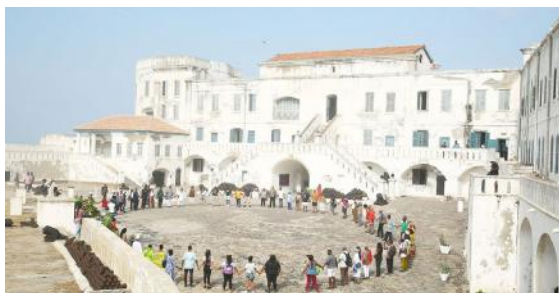
PROMOTE PAN AFRICAN HERITAGE & INNOVATION