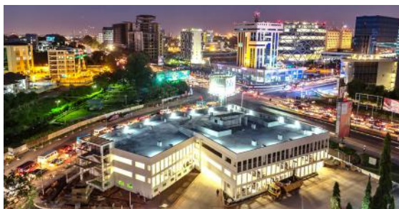
INVEST IN GHANA